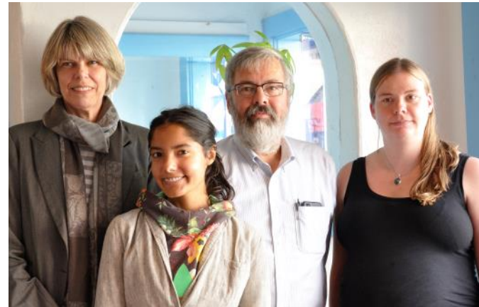
Staff members with the COINAtlantic Secretariat

The Coastal and Ocean Information Network Atlantic (COINAtlantic) has developed tools over the past 15 years to take advantage of established standards. COINAtlantic can help you share your location-based data and information in a Google searchable form. COINAtlantic can help you search for information on the internet across organizations. COINAtlantic can help you bring together the information you need onto your screen with minimal training and specialization.